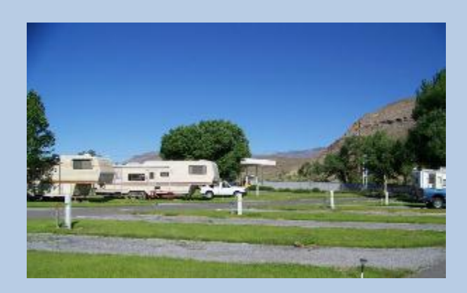
Pictured here is the I80 Smokeshop and Campground. The Paiute Tribe also operates the Big Bend RV Park.