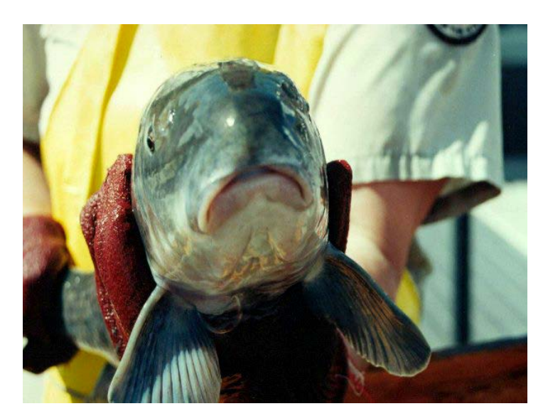
Pyramid Lake and Truckee River provide habitat for the endemic and endangered Cui-ui (pictured here) and threated Lahontan Cutthroat Trout.

The lake is also home to the Anaho Island National Wildlife Refuge, which supports one of the largest breeding colonies of American white pelicans in North America.