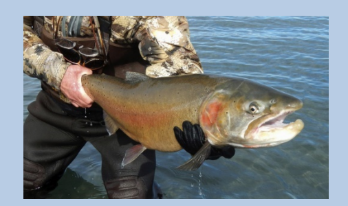
Much of the economy on the Pyramid Lake Reservation is centered on fishing and recreational activities at Pyramid Lake. Pictured is a Lahonton cutthroat trout caught in Pyramid Lake.